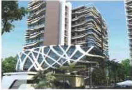
Internationally Designed Moulded Glass Club House