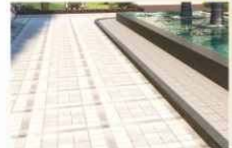
Concrete Road with Designer Footpath and Plantation along Roadside