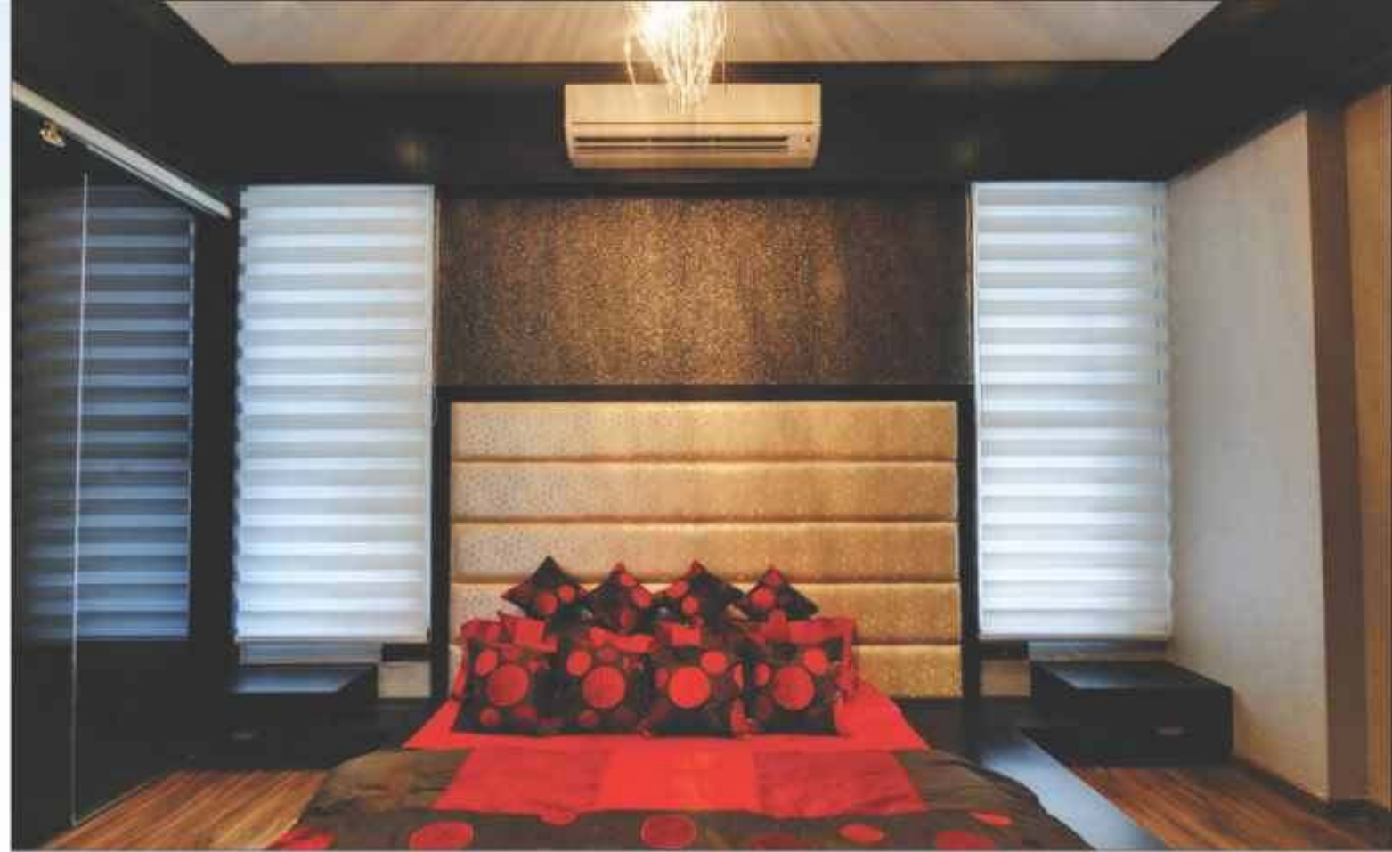
Actual sample house images