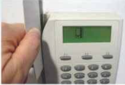
Swipe Card Entry for Car Parking in the Basement