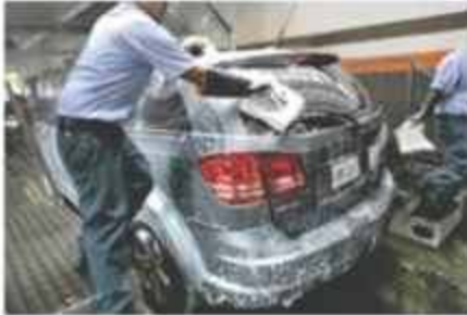
Dedicated Car Wash Area