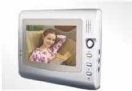
Video Door Phones