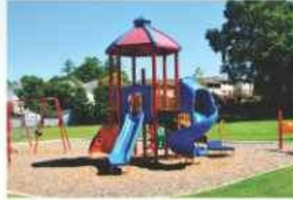
Separate Safe Play Area for Children