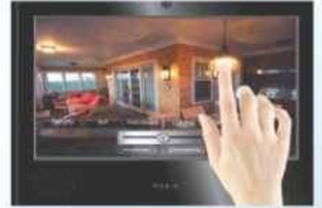
German Home Automation System