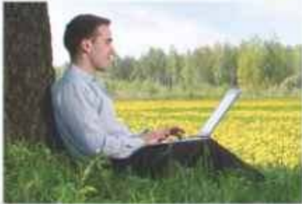
Wi-Fi Zone in Entire Campus