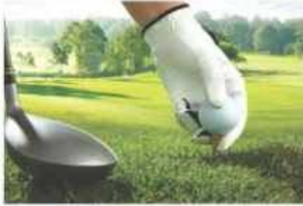
Mini Golf Course