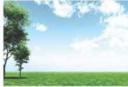
1 Lac sq. ft open space with No Vehicle Zone