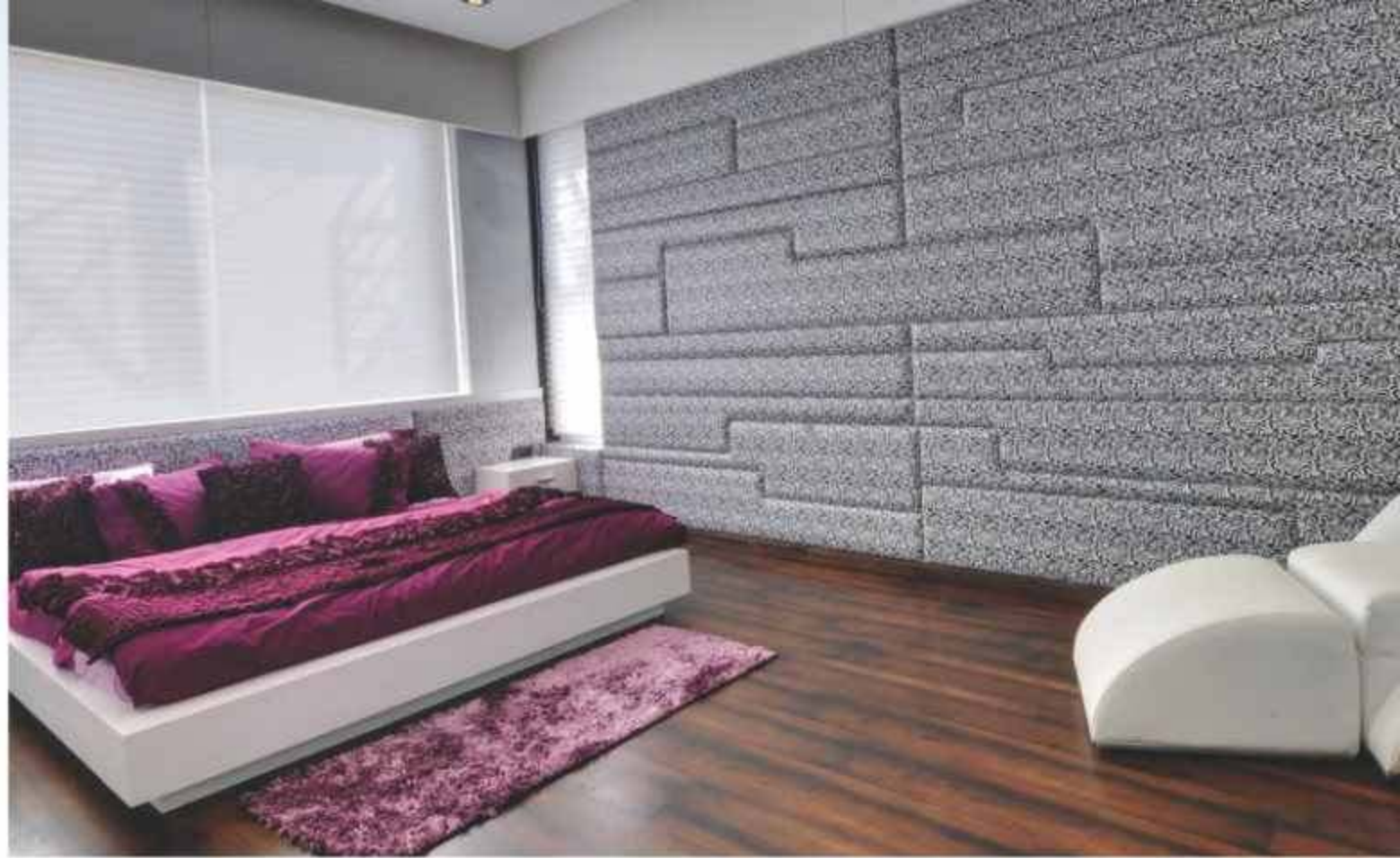
Actual sample house images