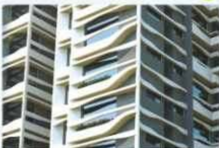
Sun breaker RCC design