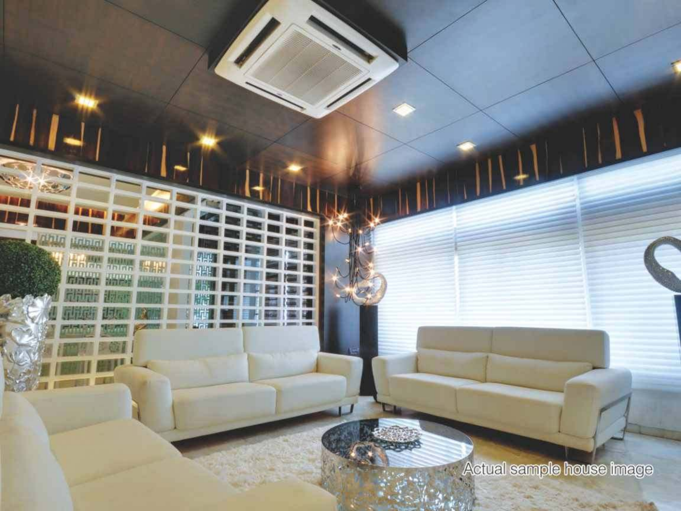
Actual sample house image