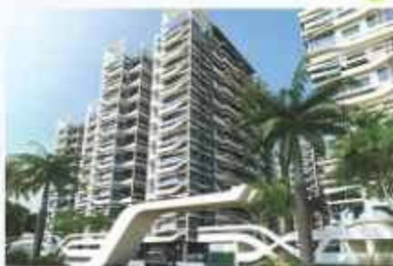
Automatic Entry Gate