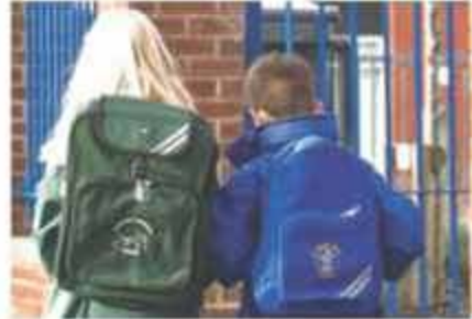
Pickup and Drop Zone for School Children at Main Gate