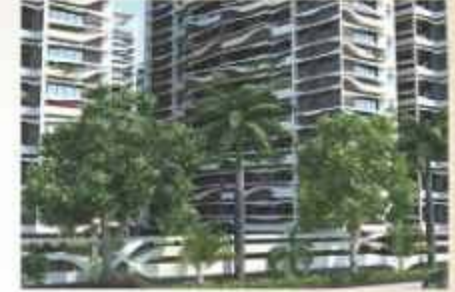
Designer Compound Wall all around the Building