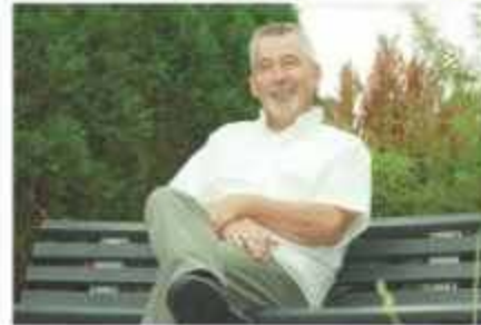
Senior Citizen Park