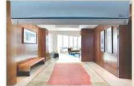
Attractive Foyer at the Entrance