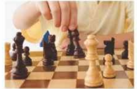
Chess & Carom