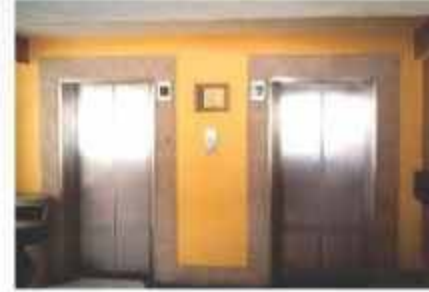
Two Elevators with Power Backup in each Block