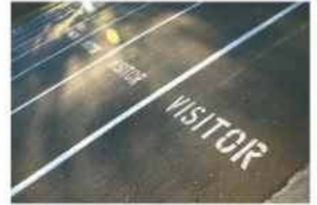
Separate Visitor's Parking inside the premises