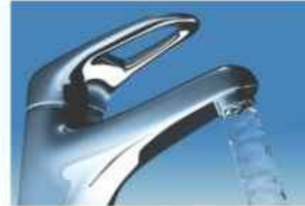
24 Hrs. Water Supply with pressurized water pump