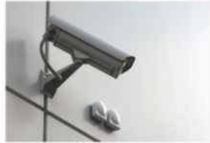
Highly Secured Area with 24 Hrs CCTV Camera Security